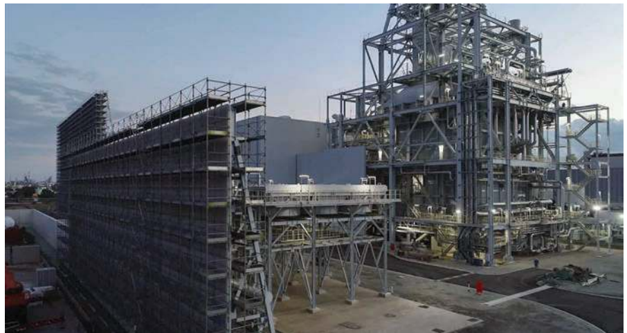
5. Power plants are loud and that can be a problem when neighbors are close to the facility. To reduce noise pollution, MHPS installed soundproof barriers, such as the wall being constructed on the left of this image.

There was a potential problem with congestion in the local community because of the T-Point 2 project. More than 7,000 employees work at the Takasago Machinery Works site on a regular basis and those numbers increased during the construction phase. Without remedies, significant traffic jams could have resulted in nearby residential areas during