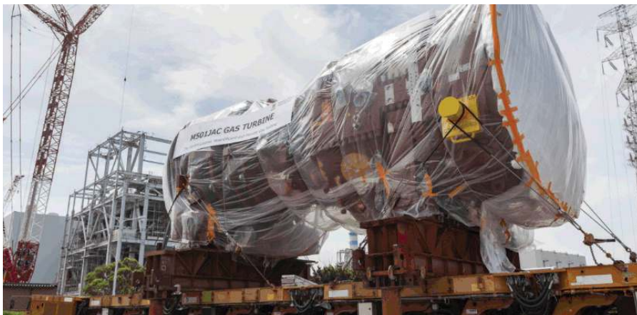
1. T-Point 2 was built to match with the M501JAC capacity.

"These demonstration plants were the first of their kind and revolutionized the way validation of advanced gas turbines is performed," Carlos Koeneké, who is now the Chief Technology Officer—Next Generation Services with MHPS Americas, said in an interview with POWER for