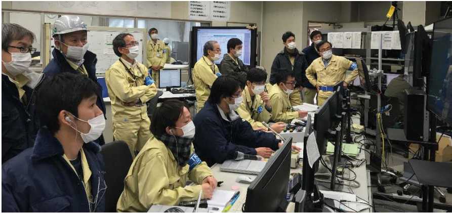
4. MHPS's project team tallied about 20,000 man-days per month on the job during the peak of construction. A group of operators and engineers are shown here monitoring testing from the unit's control room.

made to the fleet of MHPS gas turbines currently in service around the world.