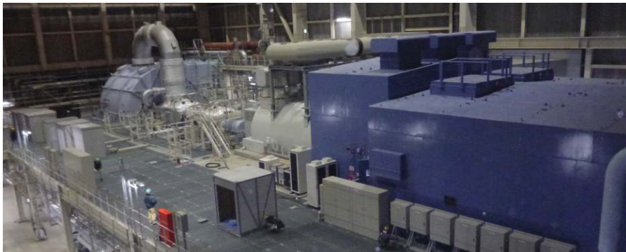
6. Excellent planning was the key to success at T-Point 2. Yet, having the design team close to the project made any necessary changes easier to enact in a timely manner. The results are shown here in a well-constructed unit.

the morning commute and at other peak travel times.