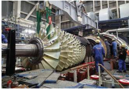
2. MHPS’s J-series gas turbines are an integration of the proven G-series design. The M501JAC adopted air cooling for combustors instead of steam cooling, which produces a high level of operability including a shorter start-up time than the M501J. The gas turbine rotor is shown here being lowered into the casing.

MHPS’s steam-cooled M501J was upgraded to the M501JAC—an air-cooled design—in 2015. The M501JAC design was verified in T-Point 1 until 2019, after which, it was offered in the market. T-Point 2 was built to match a full capacity for the M501JAC (Figure 2). The JAC at T-Point 2 will operate for approximately two years before the subsequent JAC